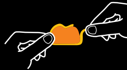
3. Remove wax